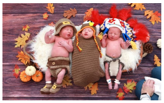
Raleigh General Hospital team members are grateful for these little blessings, dressed up and ready to celebrate their first Thanksgiving!