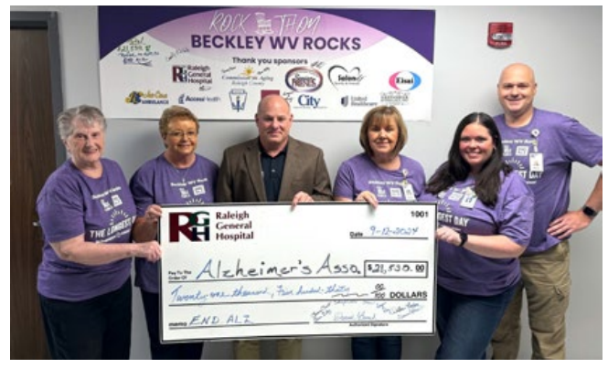
Team Beckley WV Rocks wrapped up their fundraising efforts after a successful Rock-A-Thon event, raising $21,530 for the Alzheimer's Association.